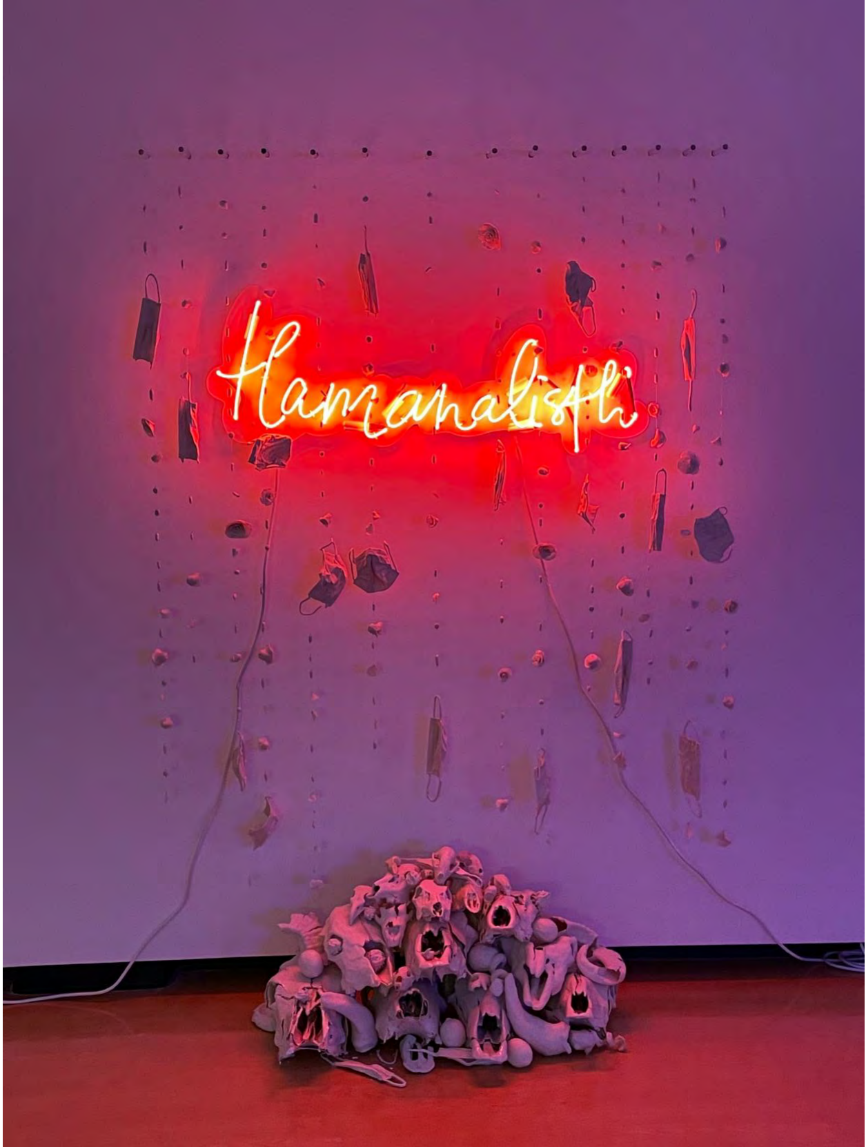
Figure 18, Tlamanalistli