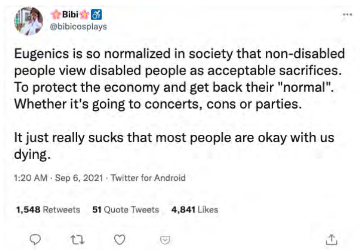
Figure 1722, Tweet, @bibicosplays

The red neon evokes feelings of anxiety, fear, evoking the literal color of blood. The skulls seem to stare directly at the viewer, hollow-eyed. Death is part of the human condition, as is a fear of death. Here is the closest this show comes to the idea of trauma itself, not merely the aftermath. The shadows and literal symbols of sickness and death provoke a sense of disquiet and hopefully confront the viewer with not only their own mortality, but their impact on those around them.