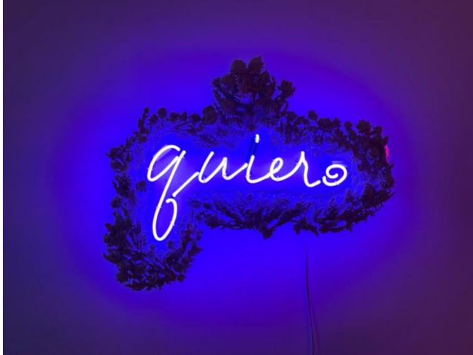
Figure 7, Quiero

- Federico García Lorca, “Canción del naranjo seco” en Canciones para terminar