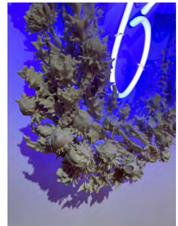
Figure 8, Quiero (detail)

In this body of work, I do not mind if the viewer makes all the same connections between text and meaning, interpretation and content, that I had when creating the work. It is a show about the pitfalls of communication; while the exact translation of each piece of text is provided, the viewer is left to more or less decipher the meaning based on their own reasoning. This unique experience, based on one’s own subjective experience, is in a way a confirmation of the thesis. Clearly these are all words, but what they mean in the end is to each their own.