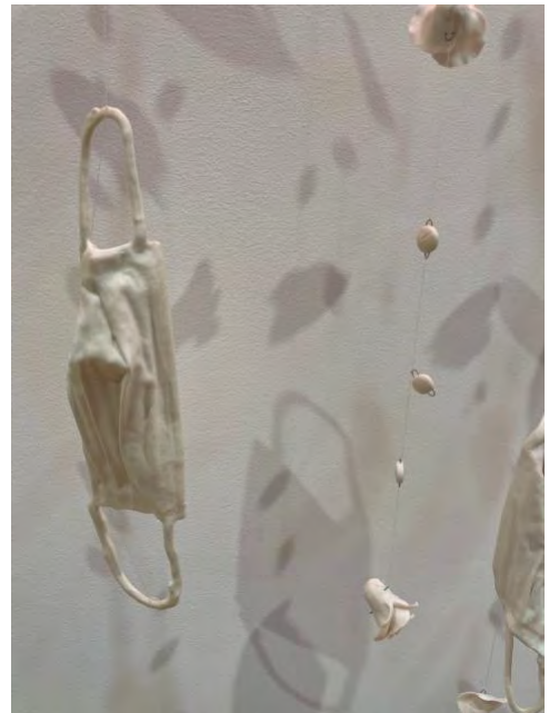
Figure 10, Tlamanalistli (detail)

I primarily utilize the preciousness, the fragility, and the translucent nature of porcelain; its suggestion of both glass and bone, its historical relationship to wealth, power, privilege, and royalty, to convey certain aspects of trauma. Pieces are broken, with sharp edges and shattered forms, evoking fragility, violence, pain, and other concepts using the inherent preciousness of porcelain to disrupt the viewer. I take the beautiful and twist it to make it uncomfortable, place the viewer in a position in between preciousness and grotesque.