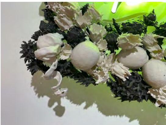
Figure 10, Beschämt (detail)