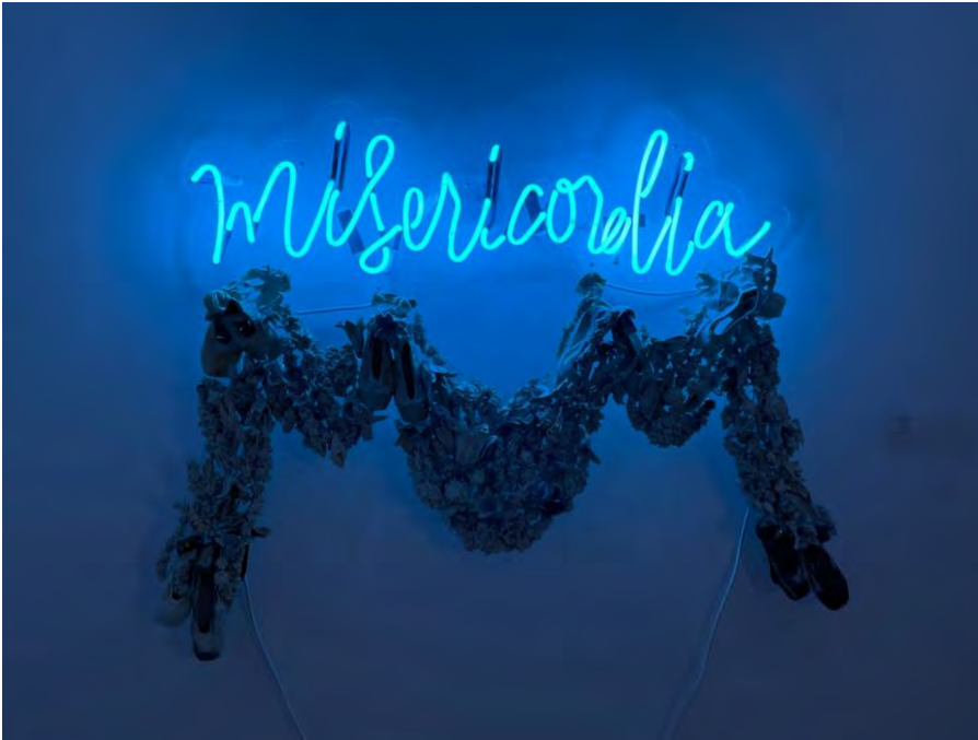
Figure 10, Misericordia

before that, μῖσος . Misery and mercy, wretched and compassionate, originating from the same source is poetic.