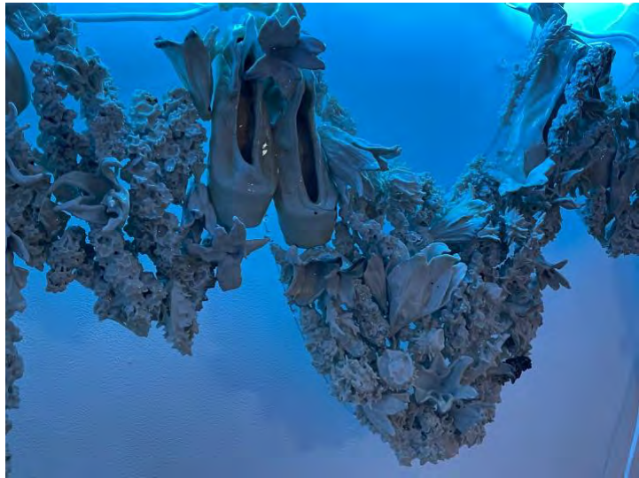
Figure 11, Misericordia (detail)

have been resurrected into a grotesque second life, as eerily beautiful in their ceramic tombs as they once were lifting their wearer into arabesques and pas de Bourrées. Underneath a dancers' shoes, though, are often mangled toes and painful feet. The messaging of the church to young women about their bodies, the spaces they're allowed to occupy, and their worth, is similarly damaging. This damage often, as with my mother, gets