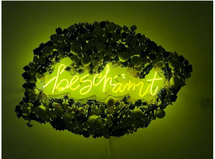
Figure 9, Beschämt

lemonade!” thinking this “silver lining” attitude will be helpful or inspiring. To be referred to as the idiom “a lemon” (buy a lemon, life hands you lemons...), meaning “something that is worthless, broken, unsatisfactory, disappointing,” is worse than an insult. What seems quaint, even cute, is literally dark and full of thorns, piled and heaped into a baroque cornucopia of excess, complicating and obfuscating meaning, souring relationships. The wall text accompanying this piece