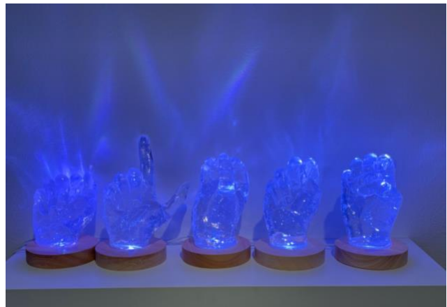
Figure 13, Alone

standing on their own separate LED pedestal. It feels cut off from the rest, an odd decision that maybe doesn't quite fit. This was entirely intentional. The feelings of isolation, of being alone with your thoughts, the frustration of being unable to connect and relate to others, that accompanies trauma, can be exponential. Compounding depression and anxiety, shame, and bullying further interfere with forming and maintaining relationships. One can feel frozen, trapped. I chose ASL for this piece in particular because speech and hearing impairment are the most physically isolating, creating very real disconnect in the ability to communicate with most people.