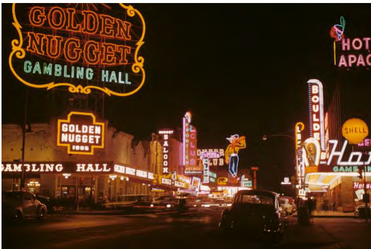
Figure 1, Golden Nugget and the Vegas Strip, c 1950

– Tom Morello (lyrics from “The Nightwatchman”)