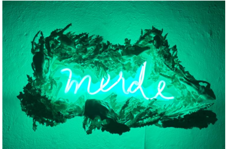
Figure 14, Merde

Shit. Shit is one of the first words I try to learn in any new language. What do you say when you stub your toe, or realize you left your phone on top of your car? It's an incredibly universal concept, and a very difficult one to translate, because it's as much an emotion as a word. Shit happens. This is a piece about all the things in life that just happen .