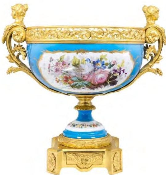
Figure 4, Sèvres Porcelain Centerpiece in Gilt Bronze mount, 1771, courtesy 1stDibs.com

shell), and later exported on ships, porcelain was held in great esteem, leading to a push for Europe to develop their own form. White tin-glazed red clay “majolica” wares served as European “mock porcelain” for many years, until in 1708, alchemist and chemist Johann Friedrich Böttger would be the one to develop the first “white gold” in Meissen for King Augustus II of Poland. This soft-paste porcelain would also be created in France at first Rouen, culminating in the royal manufactory established at Vincennes, later moving to the famous Sèvres. In the 18 th and 19 th century, every major European power boasted their own royal porcelain manufactory— Germany (Saxony-