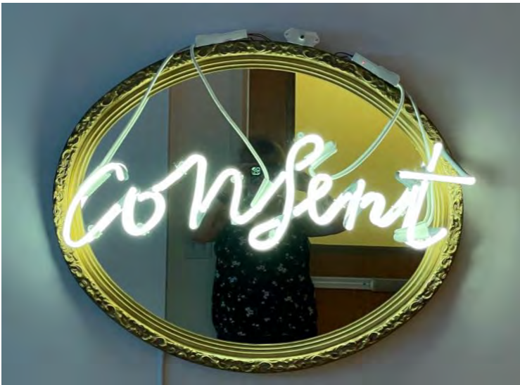
Figure 162, Consent

Consent is a "yes." Anything else is just a guess. – Cambridge University Educational Campaign